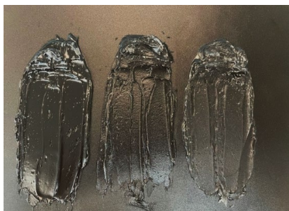
KSG-16 / KSG-19 / KSG-45

At their SCC booth, SESA representatives provided three formulation examples of the KSG-19 and KSG-45 including: